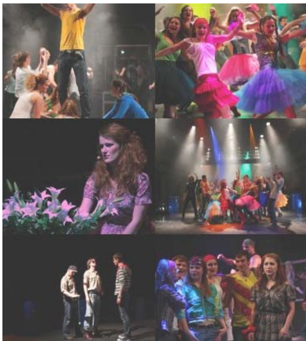
Photos from the production of 'Footloose'

http://www.facebook.com/DivadloNaOrli?ref=ts&fref=ts